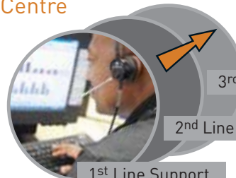
1 st Line Support